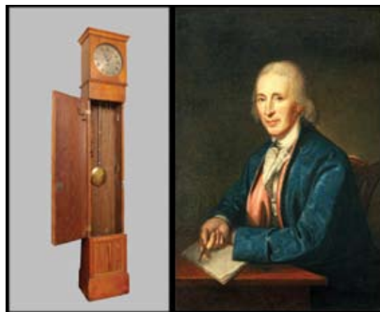
Eighteenth and 19th-century explorers like astronomer and instrument-maker David Rittenhouse (right), one of five explorers featured in the current UNDAUNTED exhibition at the APS Museum, used the stars and other celestial phenomena to calculate their locations. The astronomical clock at left was constructed by Rittenhouse in 1769 to serve as a timekeeper for Transit of Venus observations.