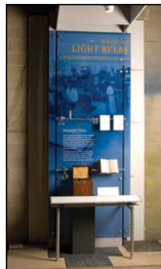
A sample glow panel for the Chemical Heritage Foundation's Making Modernity exhibition takes shape in the workshops of Maltbie, the exhibit fabricator. The exhibition opened this fall in Philadelphia.

Hidden within the historic area of Philadelphia is the Chemical Heritage Foundation (CHF), busy creating a new museum space to showcase its impressive collections. Over 10 years in the making, the new galleries hold permanent and temporary exhibitions dedicated to highlighting the connections between science, art, and everyday life. With its new museum, CHF aims to balance accommodating both a highly knowledgeable audience and the general public. In fact, this is where, according to the head of the foundation, "If Franklin were to return... he could catch up on the biggest changes in the intervening 200 years."