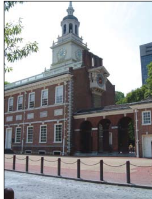
Philadelphia's Independence Hall is, by every estimate, the birthplace of the United States.