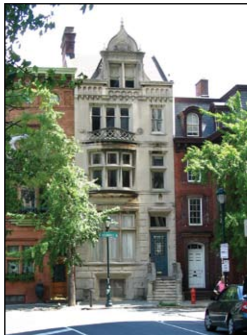
Late 19th-century townhomes and apartment buildings line the streets near Rittenhouse Square.

The area around the Square is a shopper's paradise, boasting such stores as Lacoste, J.Crew, Urban Outfitters, BCBG, Kenneth Cole, and more. Some of Philly's most fashionable and inventive restaurants are here as well. The Continental Midtown is an upscale lounge with a retro twist—be sure to try their Buzz Aldrin Martini (featuring Tang around the rim). Philly is known for its cost-saving BYOB (bring your own bottle) scene, and the Rittenhouse's Audrey Claire , a Mediterranean café, and Matyson , with its contemporary American menu, are some of the finest.