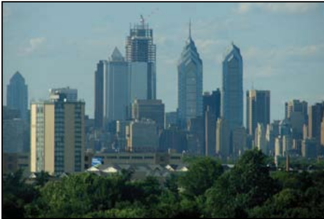
Philadelphia city skyline

Philadelphia represents an exciting mix of early American history and bustling modern metropolis. In the space of a single day, you can walk the same streets that Benjamin Franklin and Thomas Jefferson walked and enjoy a world-class contemporary orchestra or science museum. The fifth largest city in the United States, Philadelphia is home to the Liberty Bell and Independence Hall, icons of the American Revolution, and to an electrifying dining and nightlife scene.