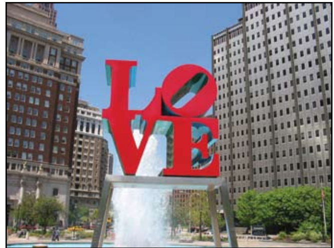
Robert Indiana's famous LOVE sculpture was placed in Love Park in 1976 as part of the United States' Bicentennial celebration.

Local restaurants of note in the district include the Belgian Café , with food to match its name, and the Rose Tattoo Café , featuring American Continental food and seasonal floral arrangements.