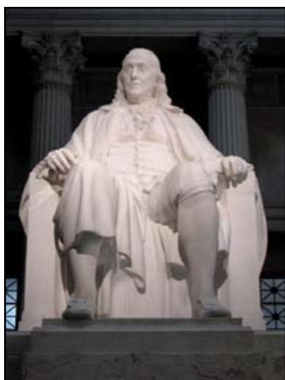
The Benjamin Franklin National Memorial, located in the rotunda of The Franklin Institute, features an imposing statue of the writer, inventor, and American statesman sculpted by James Earle Fraser between 1906 and 1911.