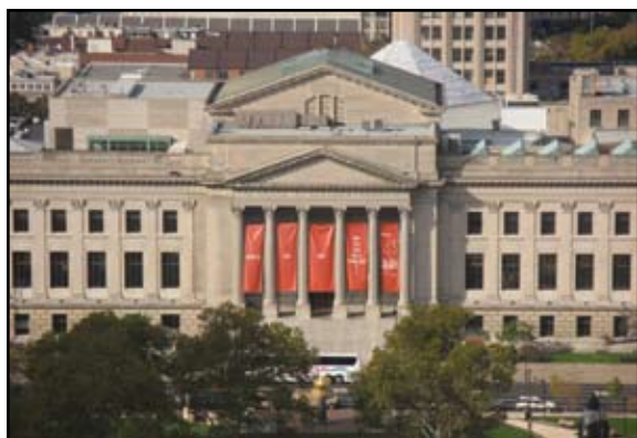
The Franklin Institute, founded in the spirit of inquiry and discovery embodied by Benjamin Franklin, opened to the public on January 1, 1934.