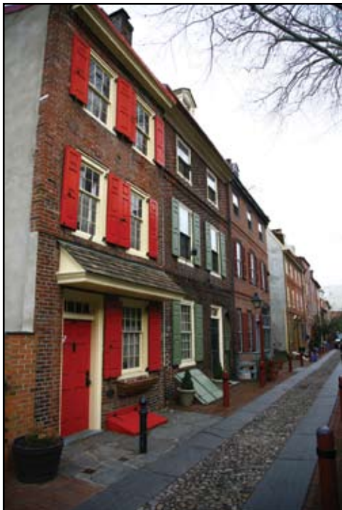
Elfreth's Alley, located in Old City Philadelphia, is the oldest continually inhabited street in the United States.

Taverns and restaurants are also plentiful here. Have a drink at National Mechanics , a bank-turned-church-turned-bar that has preserved pieces of its past since its founding in 1837. For a unique dining experience, try Cuba Libre , a restaurant reminiscent of Havana in the 1940s, with delicious fare and exotic mojitos.