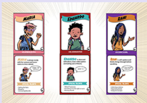
Character Cards highlight the interests, traits and special talents of the three main characters.

The three main characters in the narrative embody different approaches to scientific inquiry. Maria represents the documentation and collection of evidence, Eduardo embodies the generation of hypotheses (sometimes involving aliens), and Rani is a true science nerd with an intense interest in analyzing evidence using a variety of technologies and techniques.