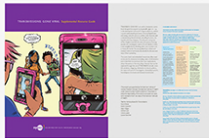
The supplemental resource guide provides educators in informal settings with NGSS-aligned activities to engage students in thinking through the concepts of what constitutes evidence, practicing scientific inquiry skills, and disease transmission between human and nonhuman animals.

The comic book is accompanied by a supplemental resource guide for implementation and support in informal settings.