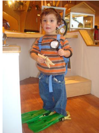
Science Process Skills