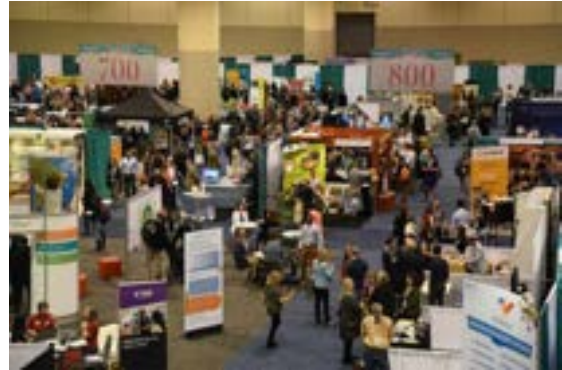
EXHIBIT HALL STAGE SPONSOR - $7,500 (EXCLUSIVE)

In addition, dedicated programming and several food and beverage events will also be located in the Exhibit Hall, providing additional reasons for individuals to spend significant time in the hall.